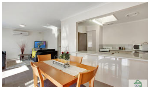
Unit 6, 86 Elgin St, Morwell