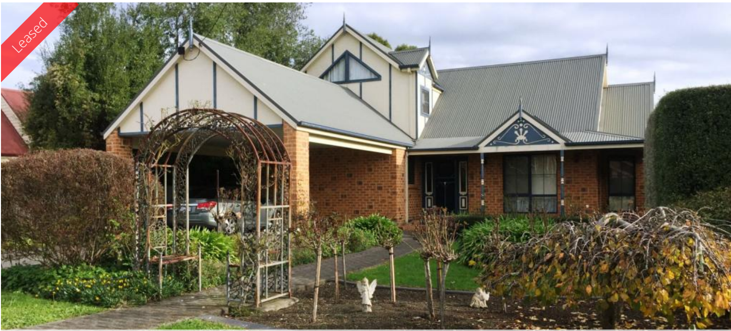
5 Wilson Court, Trafalgar