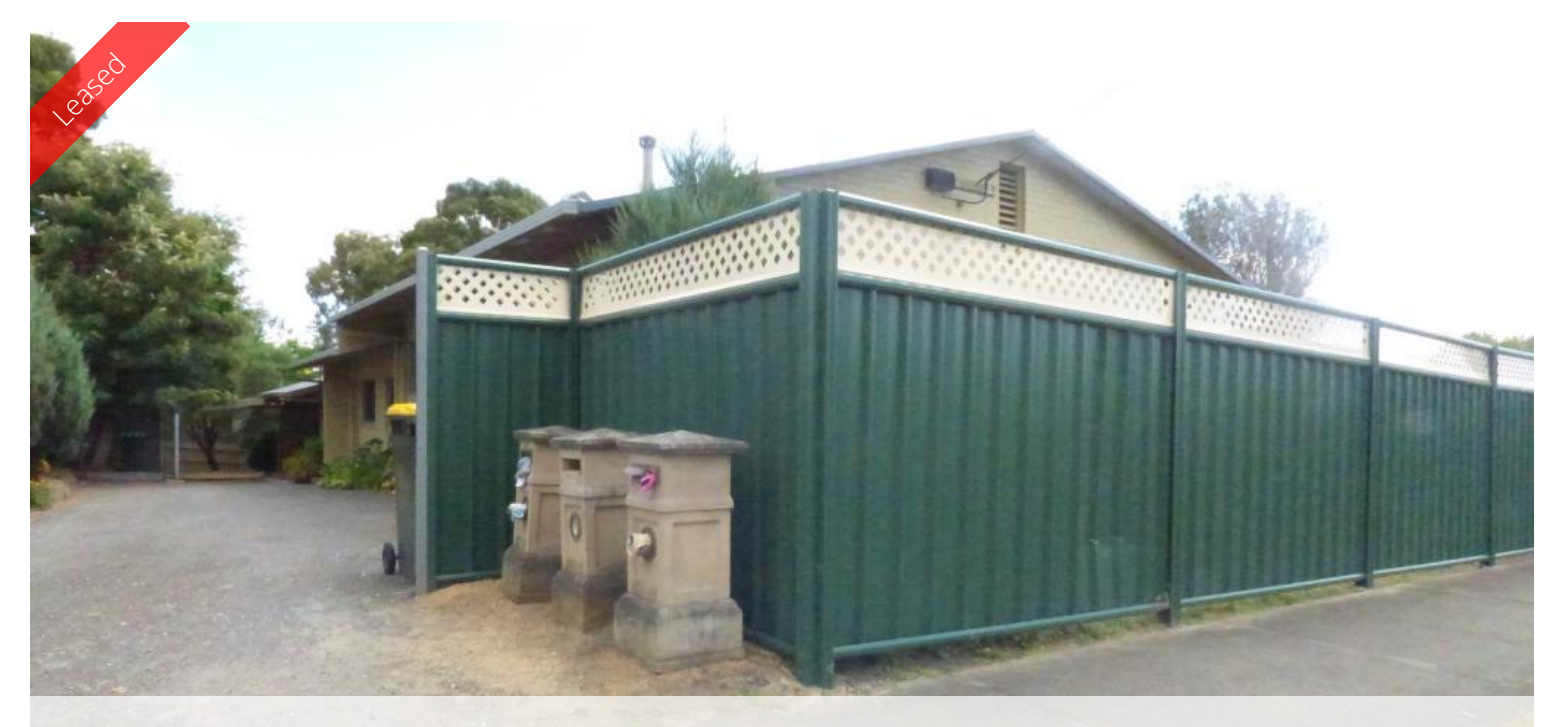
Unit 3, 12 Reservoir Rd, Moe