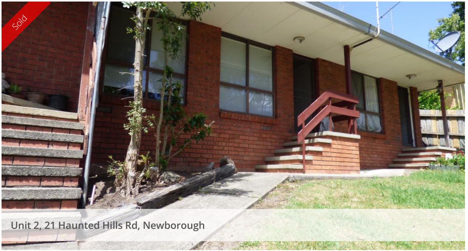
Unit 2, 21 Haunted Hills Rd, Newborough