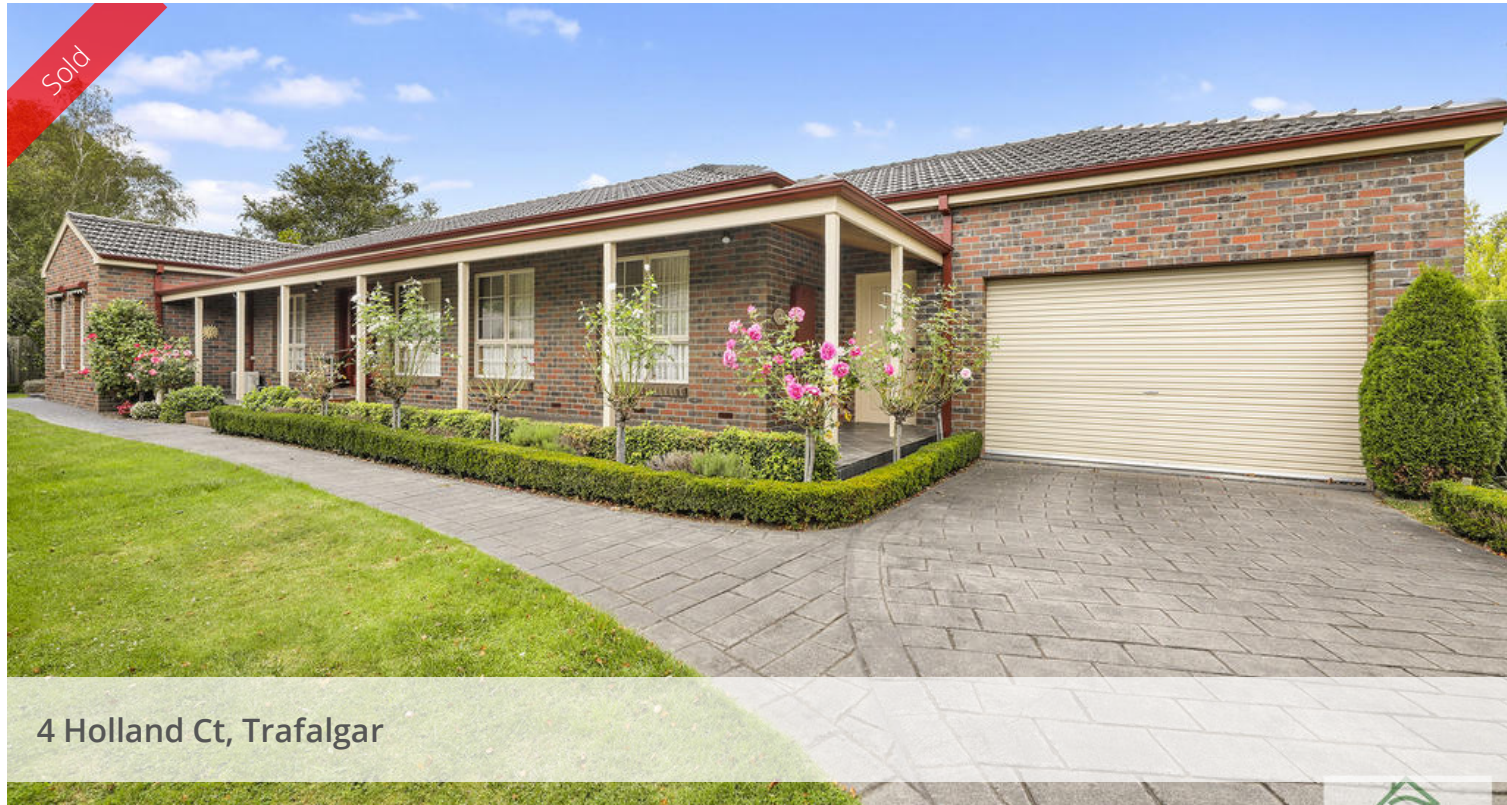
4 Holland Ct, Trafalgar